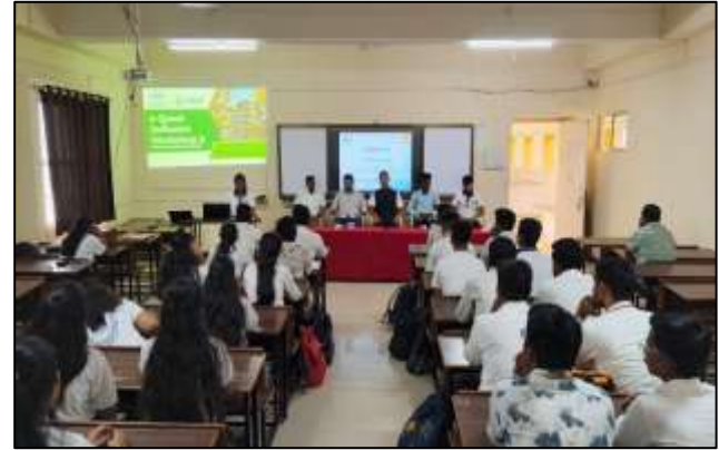
Photo 2: Interactions with students