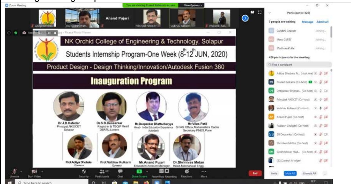
One Week Internship Program organised by Mechanical Engineering Department.