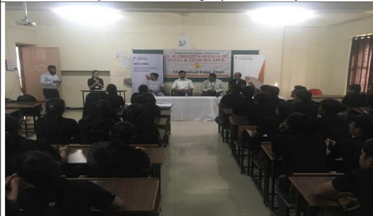
Boot Camp for S.E. Students from DBATU "Product Design Engg"