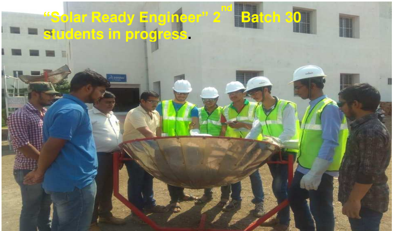
“Solar Ready Engineer” 1 st Batch 54 students trained for 120 Hrs Course.