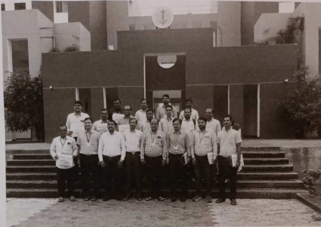
Group Photo of Team NKOCET Mech after valedictory program

A handwritten signature in blue ink, appearing to read 'Adh'.