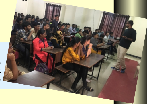
Abroad Students Expert Sessions