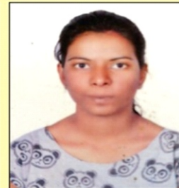
Bansode Dhammapali NIT Agartala