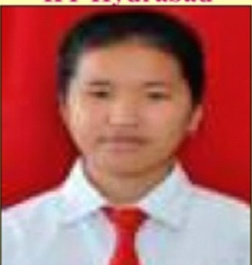
Mena Ipuu NIT Jamshedpur